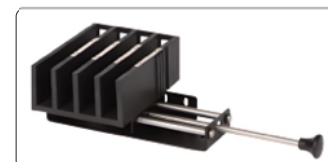
manual 4-cell holder (optional)