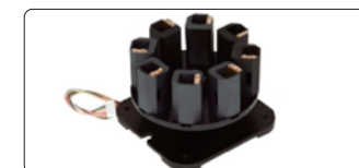
auto 8-cell holder (optional)